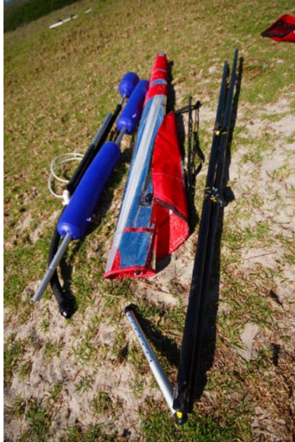
...and take out the parts.