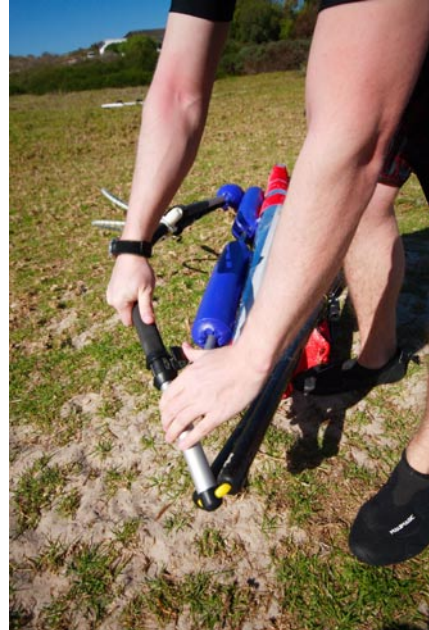
Attach the boom to the front tubes with the U-pin lock.