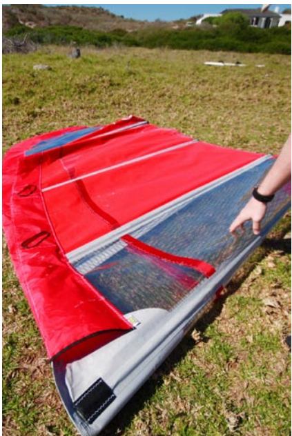
Then roll out the sail and fold it as shown in the picture.