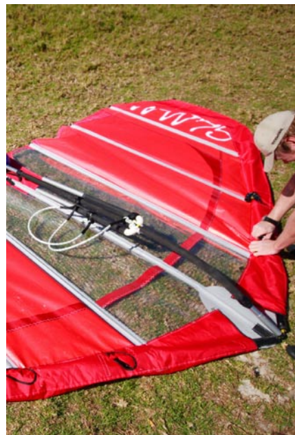
Pull out the tube joints through the openings...