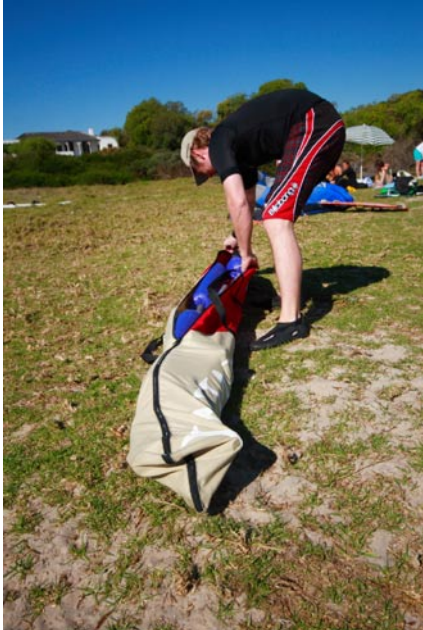
Open the bag...