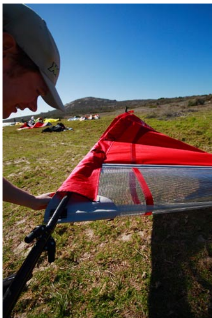
Push the front tubes all the way inside the front tube pockets.